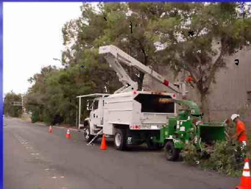
CITIZEN SERVICE REQUEST SYSTEM