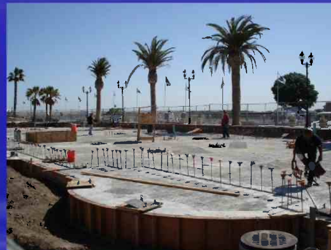
MARINA COMMERCIAL BLDG (UNDER CONSTRUCTION)