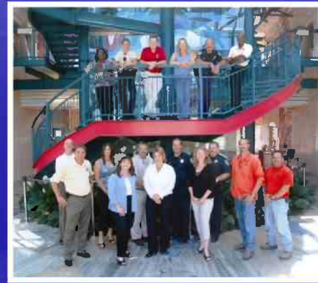
CITY-WIDE NEIGHBORHOOD IMPROVEMENT TEAM