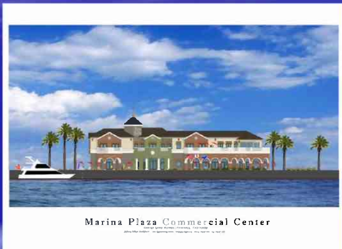
MARINA COMMERCIAL BLDG (DESIGN)

PROJECT UNDERWAY! - MARINA LOWY COMMERCIAL BUILDING: