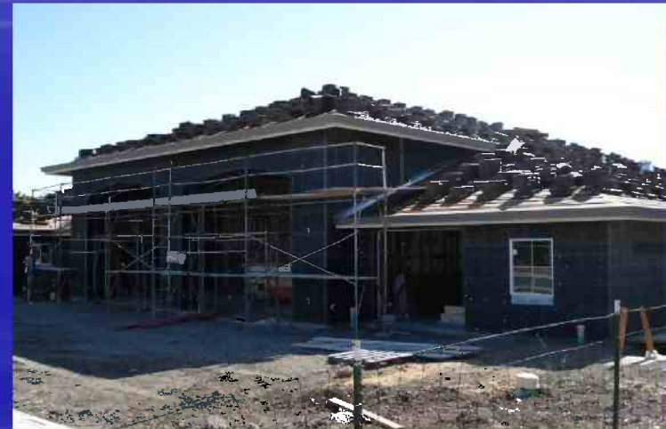
FIRE STATION #85 (UNDER CONSTRUCTION)