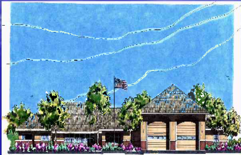
FIRE STATION #85 (CONCEPT/DESIGN)