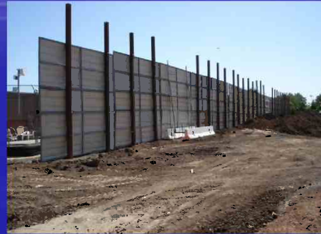
COURTHOUSE (UNDER CONSTRUCTION)