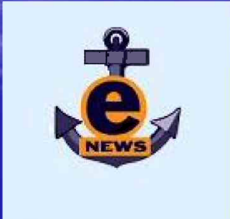
ANCHORLINES & CITY eNEWS