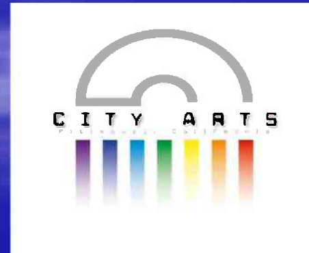
PUBLIC ARTS & CITY NON-PROFIT ORGANIZATION