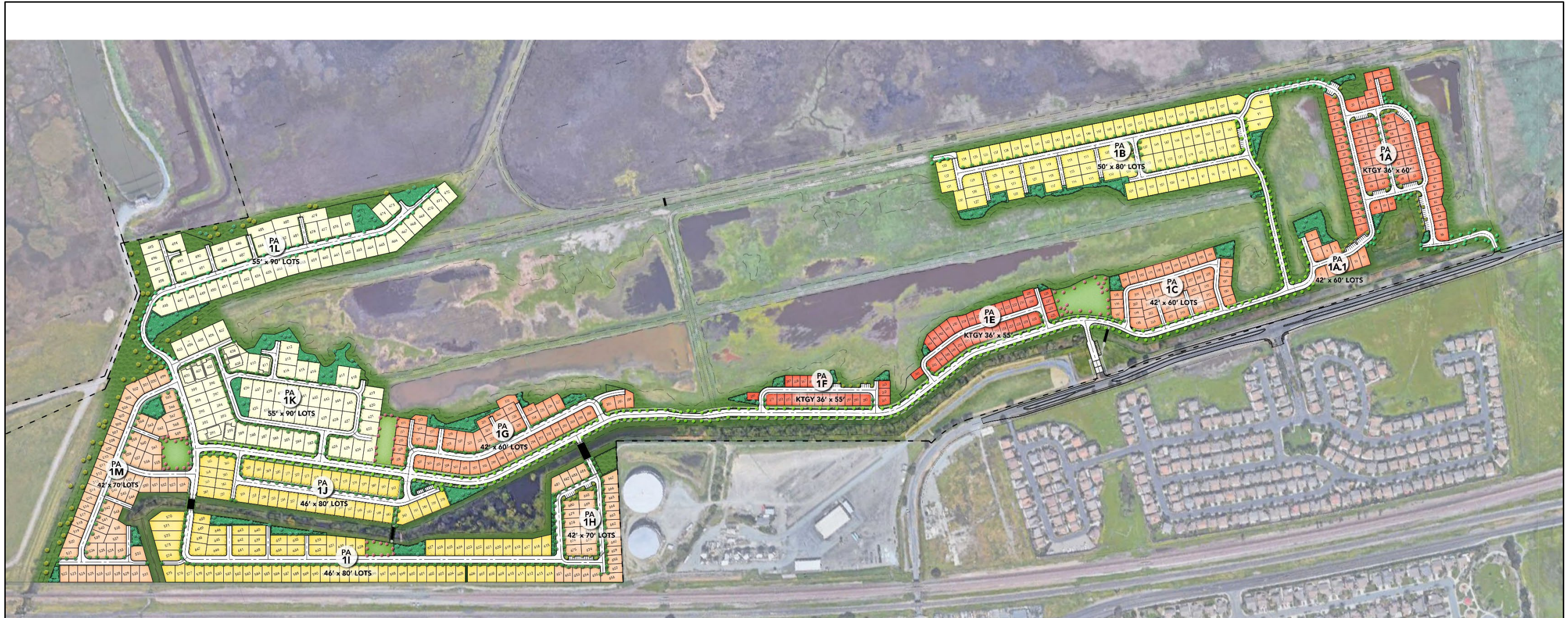
Figure 8 Preliminary Village I Site Plan

Walk RG | CA COMMUNITIES | 20-054 1 | 24