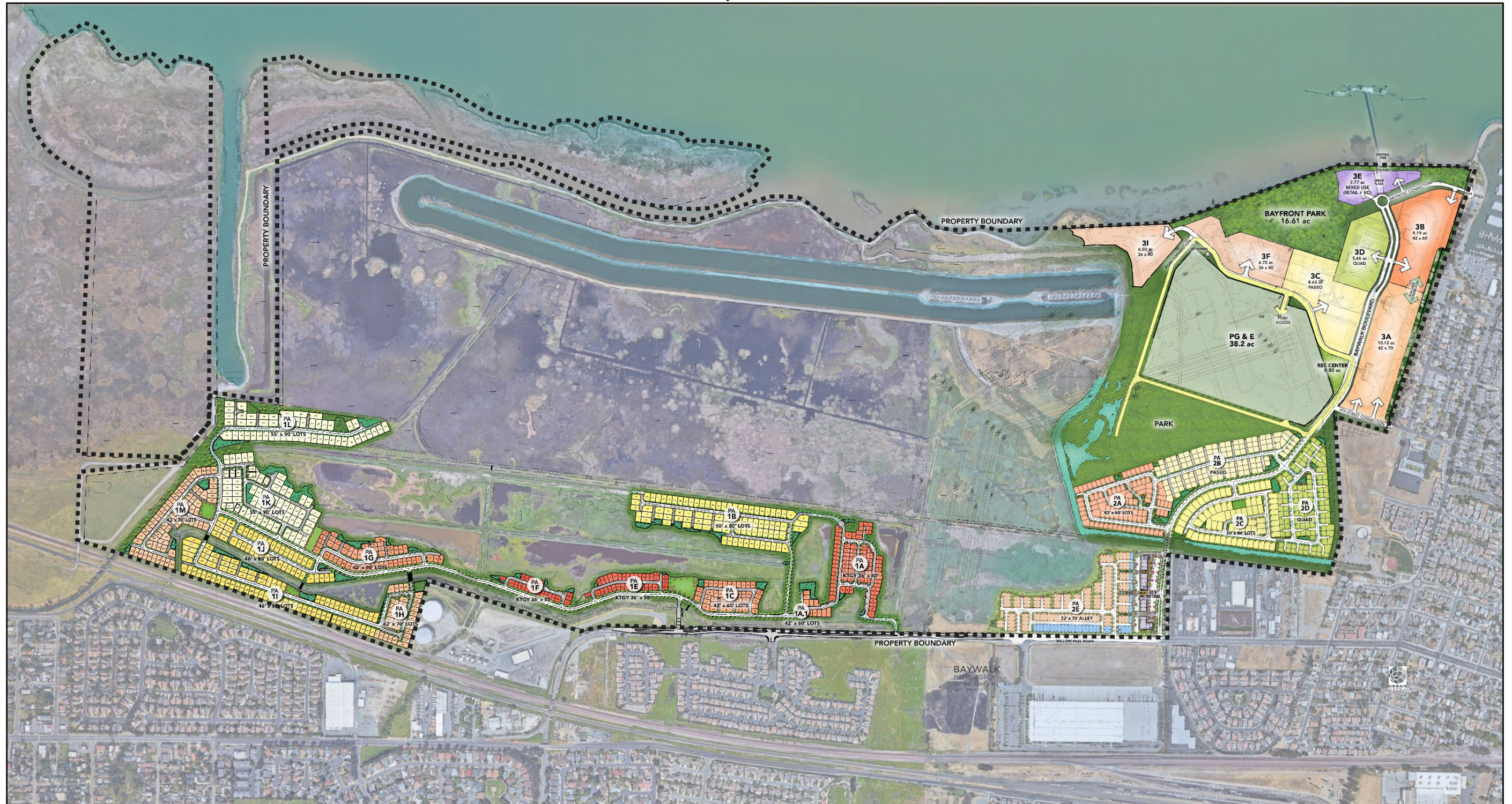
Figure 3 Preliminary Overall Site Plan

BayWalk PITTSBURG | CA INTEGRAL COMMUNITIES | 20-054 DATE 02 | 21 | 24