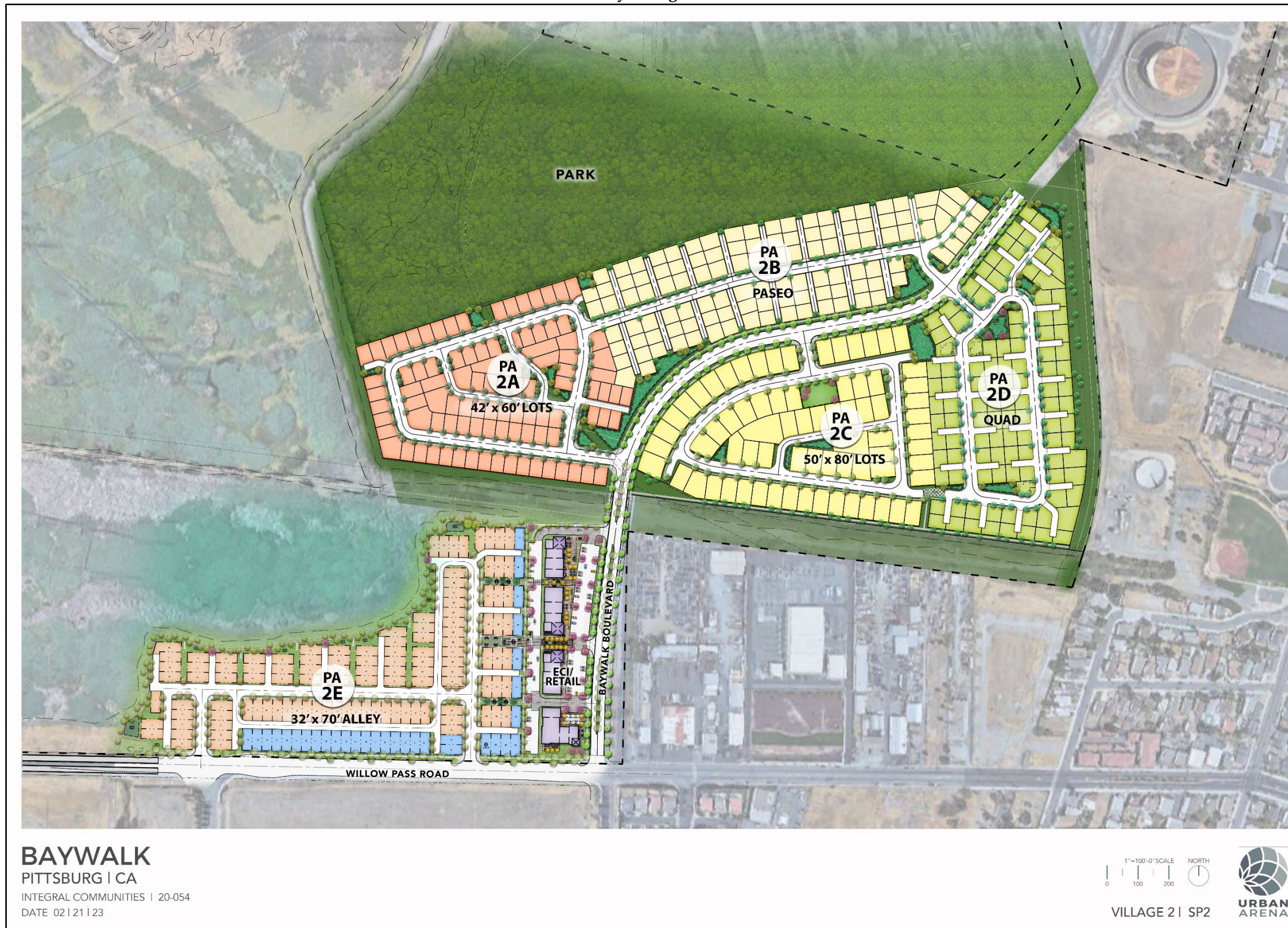
Figure 9 Preliminary Village II Site Plan