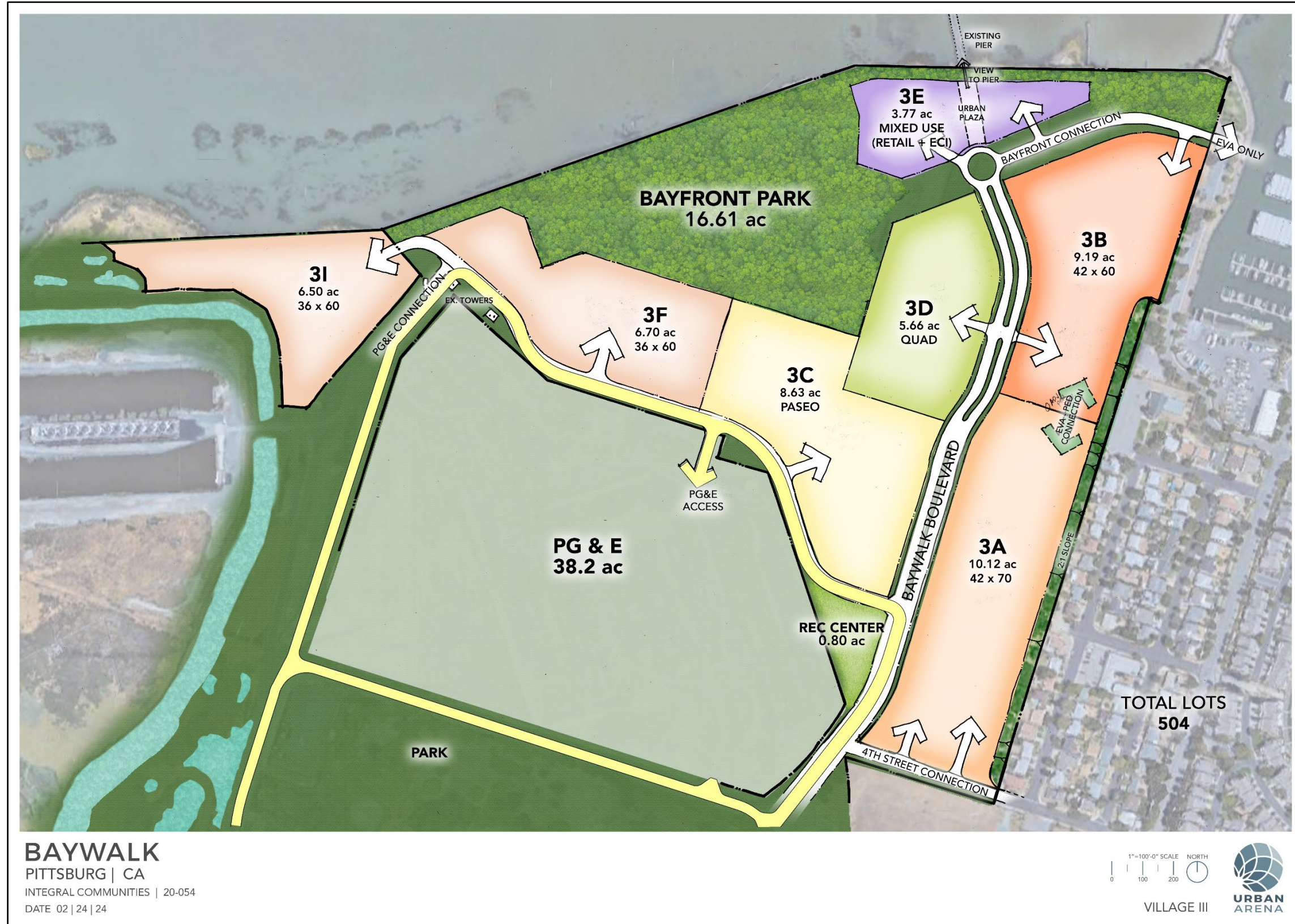
Figure 10 Preliminary Village III Site Plan