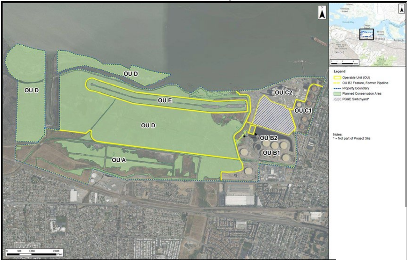
Figure 7 OU Location Map