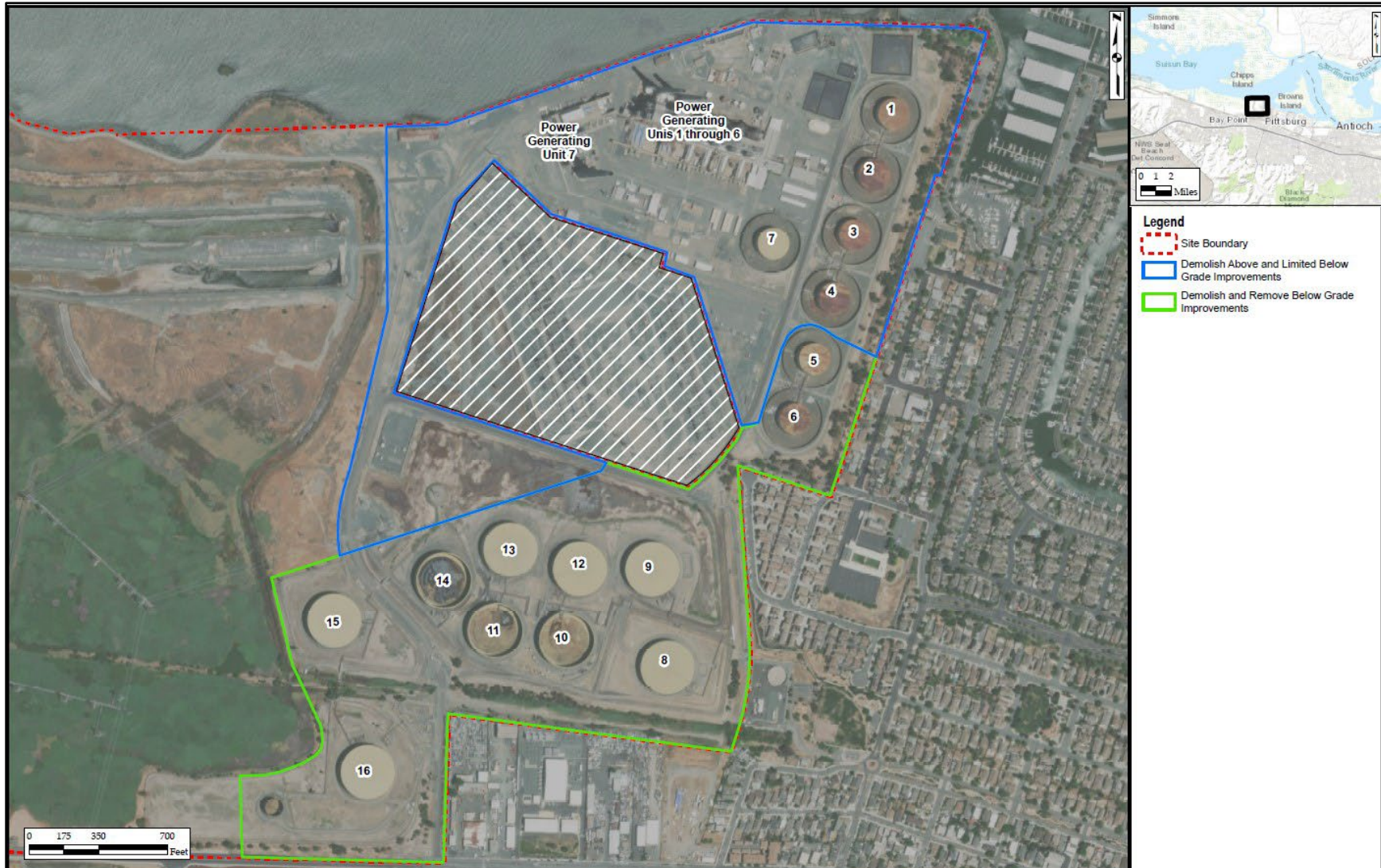
Figure 4 Demolition Plan (1)