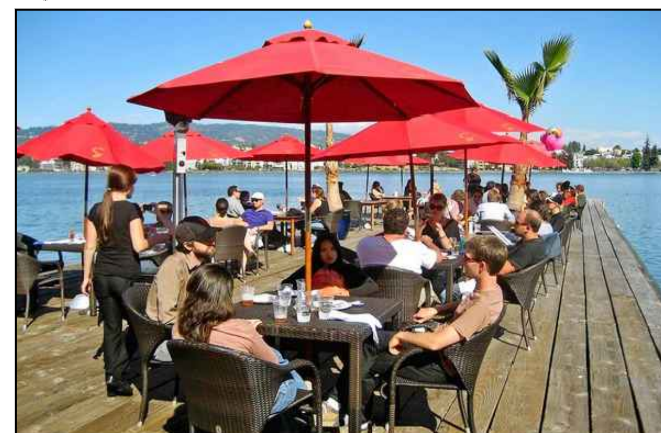
(D) HARBOR/BERTH DINING