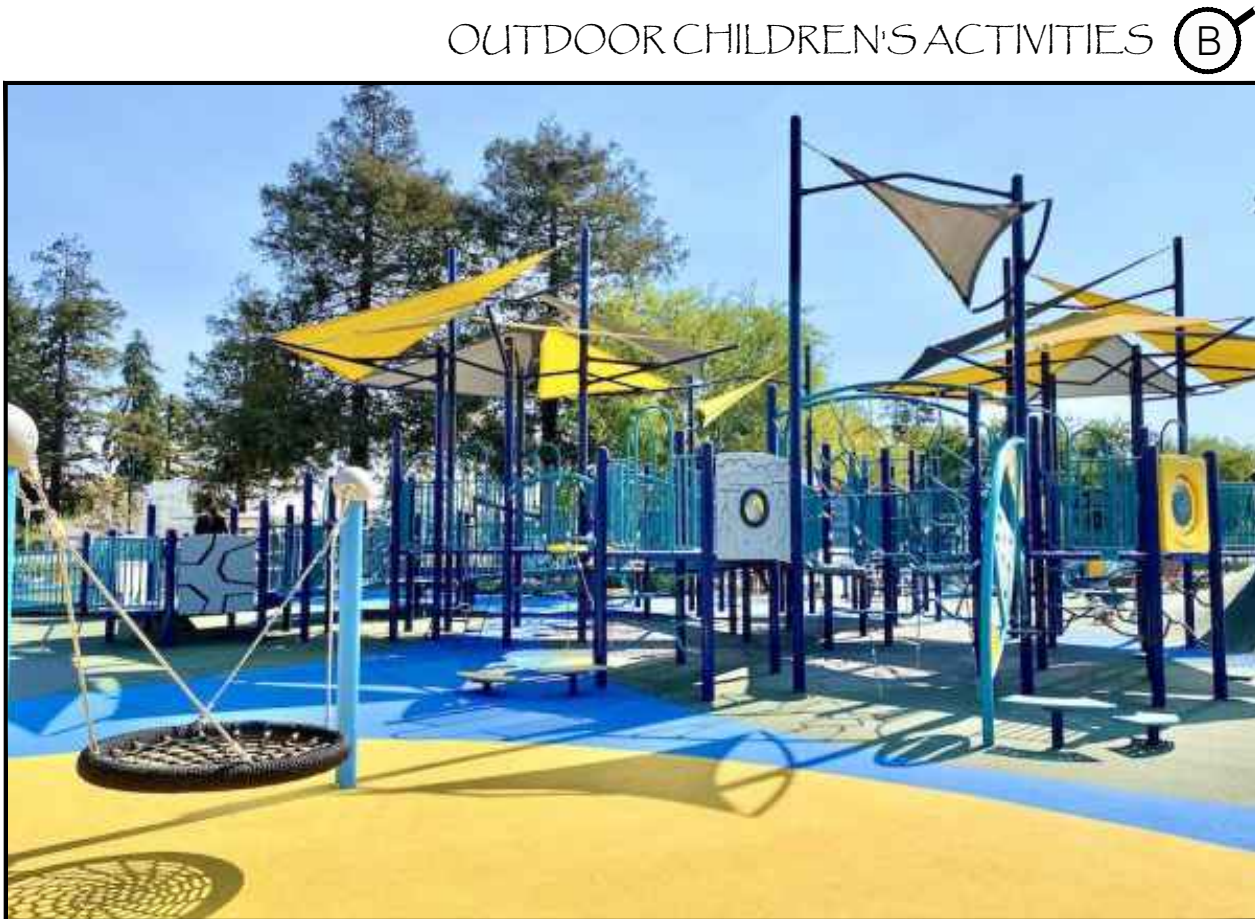
OUTDOOR CHILDREN'S ACTIVITIES (B)