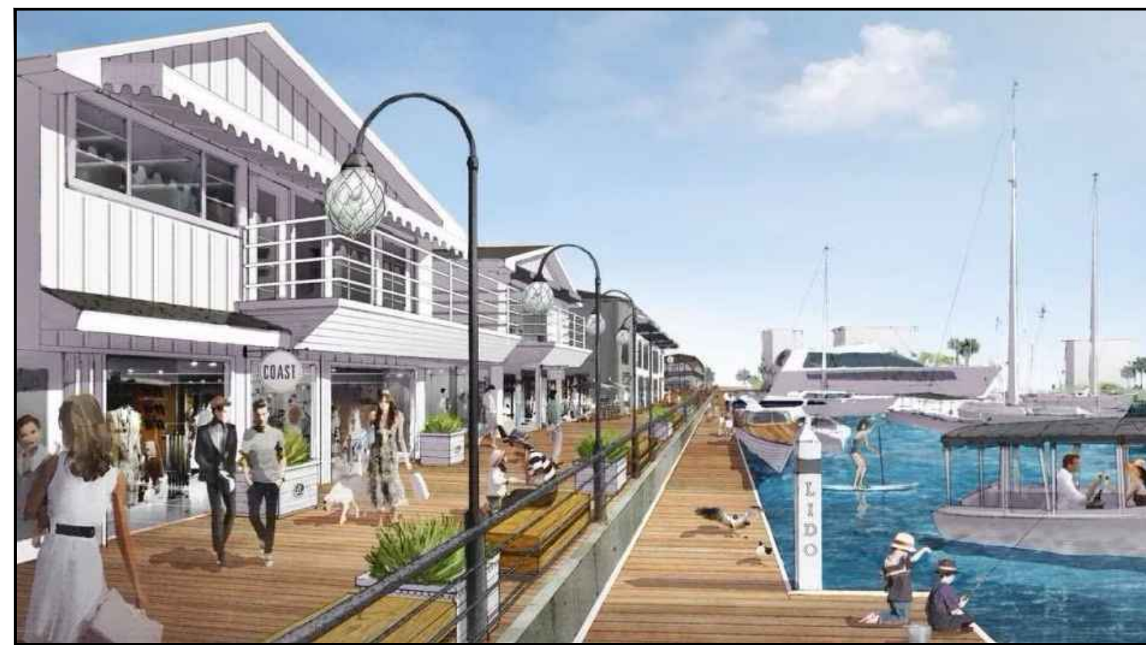
WATERFRONT RETAIL/PROMENADE (A)