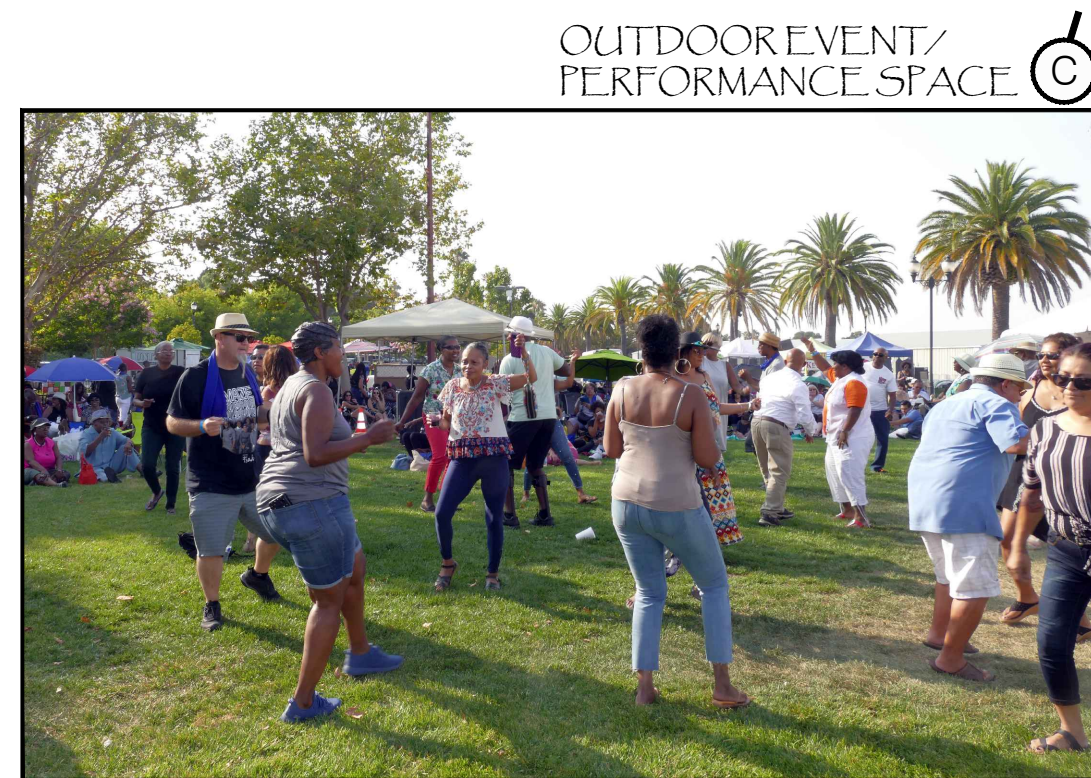
OUTDOOR EVENT/ PERFORMANCE SPACE (C)